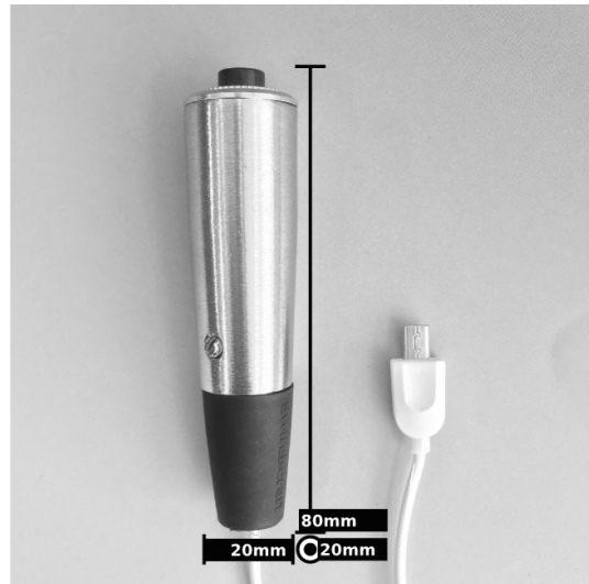
Fig. 1. Ergonomic handheld design.

A common need when recording biosignals is the annotation of meaningful events that occur during the recording session, synchronously with the biosignal data. This ergonomic handheld manual button was specifically designed for that purpose.